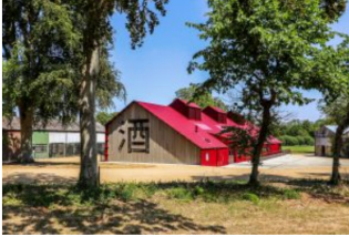
Dojima Sake Brewery at Fordham Abbey by SCABAL with KPTA