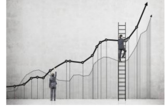
Working in architecture: which job roles are more likely to receive pay rises?