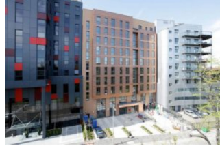
Stride Treglown faces court battle over 'dangerous' façade on Croydon hostel