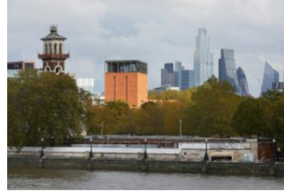
Building study: Lambeth Palace Library by Wright & Wright